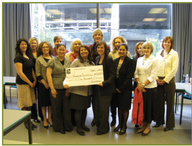
RBC cheque presentation to Minerva Helping Women Work on June 1st

The Minerva Helping Women Work™ program is entering its 6th year and preparing for the launch of its 16th cohort on September 28th with a group of up to 20 professional women who are seeking their futures and discovering their ideal careers. Welcome and Best Wishes to each of you as you approach this phase of your journey!