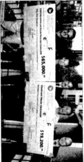
Canada Post Foundation for Mental Health donated $242,480 to five B.C. mental health organizations.

Intels and Mortgage Intelligence raised $64,000 for the purchase of items